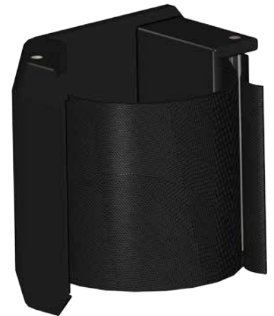
Clamp x 4